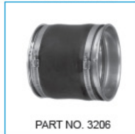
PART NO. 3206