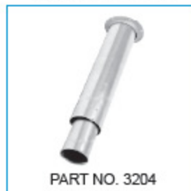
PART NO. 3204