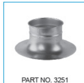
Bell Mouth Adapter